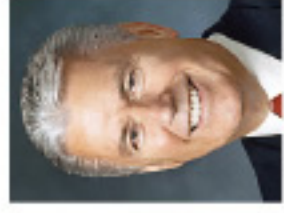
Dieter F. Uchtdorf Second Counselor