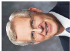
D. Todd Christofferson