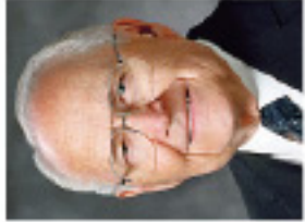
L. Tom Perry