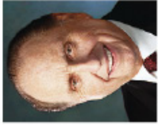
Thomas S. Monson President