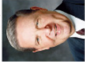
Jeffrey R. Holland