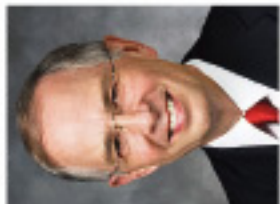
Neil L. Andersen