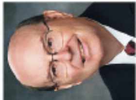
Quentin L. Cook