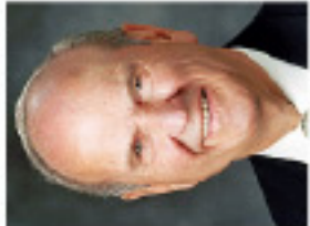
Russell M. Nelson