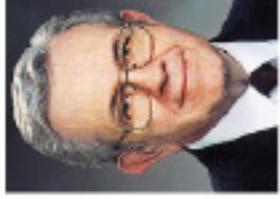
Boyd K. Packler