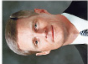
David A. Bednar