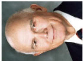
Dallin H. Oaks