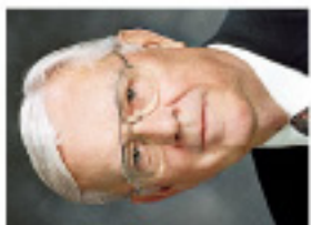
M. Russell Ballard