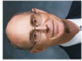
Henry B. Eyring First Counselor